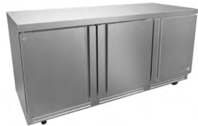
AUR 72 P