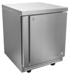
AUR 27 P