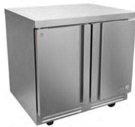
AUR 36 P